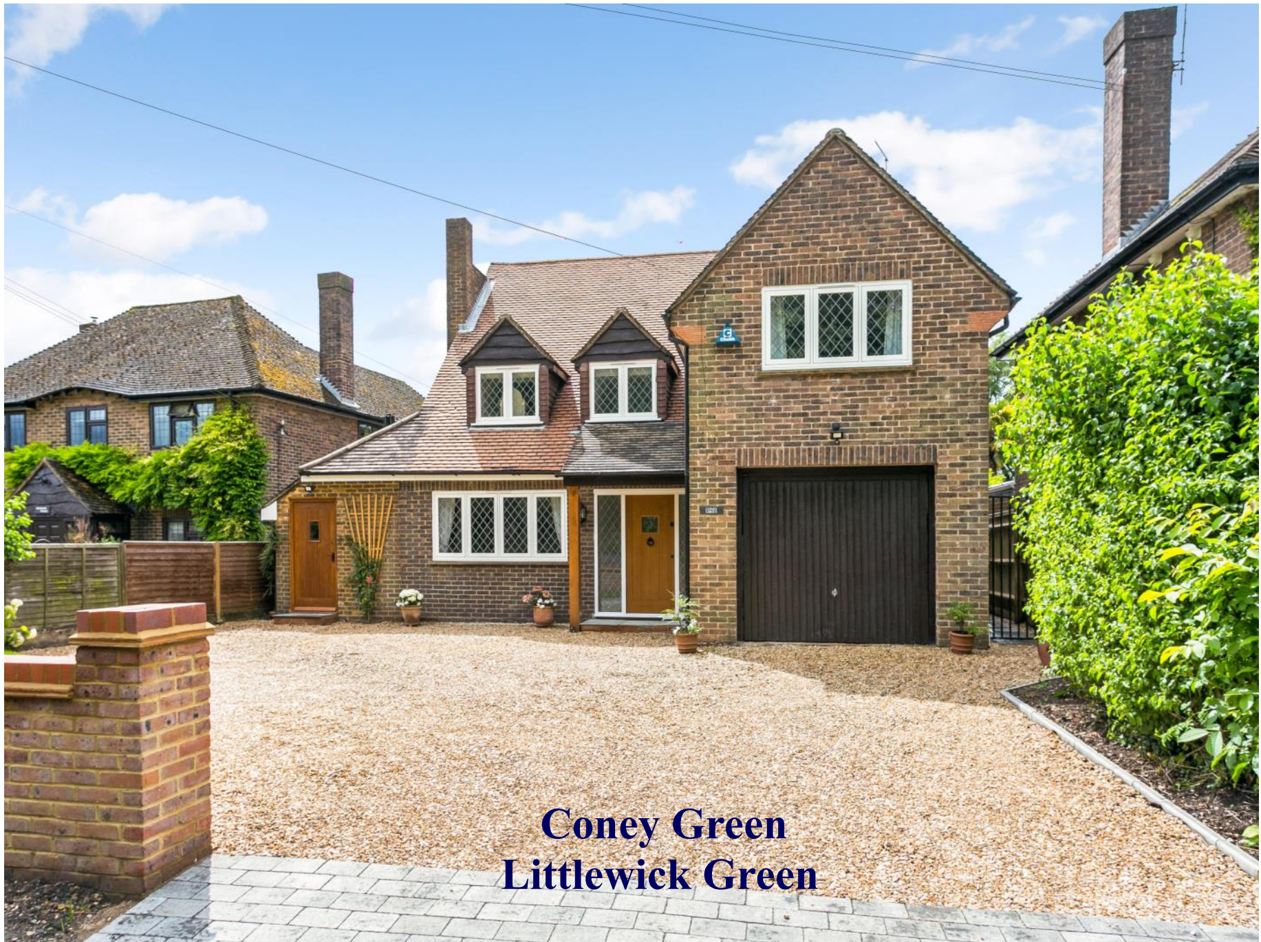
Coney Green Littlewick Green